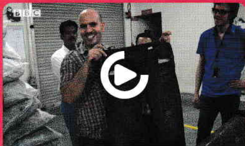
BBC DISTRESSING JEANS

1 Watch the BBC video. For the worksheet, go to page 116.